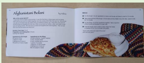
'Eat With Us', RSD's recipe book

Resolutions go and I'm sure it will help get past these dark times. I'm looking forward to the day when once again we can again share a feast with neighbours, friends and family."