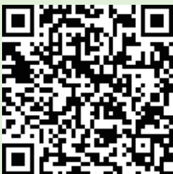
The 400 appeal

So when lockdown ends, if you're intending to do something like a triathlon or a marathon - and you will be collecting sponsorship - then please could you think about nominating RSD as your chosen charity? Let us know what you will be doing and we can help promote your challenge in our newsletter and via social media. Even if you aren't contemplating anything quite as energetic you can help. Donations via bank transfer can be made through our bank account, Refugee Support (Devon) Ltd., Cooperative Bank account number 65849280, sort code 08 92 99. If you would like to make a regular donation please ask us about our 400 appeal , which aims to get 400